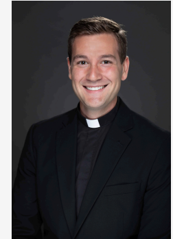
Priests from our parish