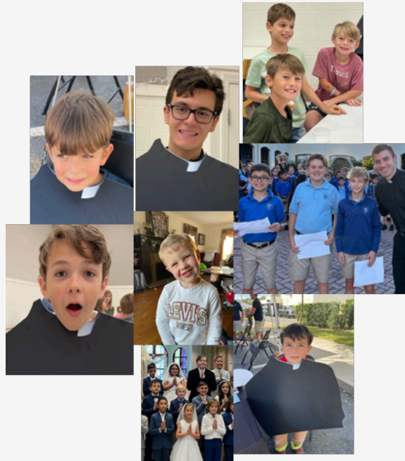
Where Vocations Begin