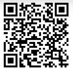
Life Teen Meals

On Sunday evenings we intentionally feed our High School students before we start on Sunday night. This is not done just to get food in their stomachs, but we recognize the need for them to sit around a dinner table together with their mentors as an important part of the ministry to build relationships. Food is prepared by a group of parents or other parish ministries, such as our Men's Club, Womans Club and Knights Of Columbus who help provide dinners. We ask parents to sign up online two times a year to help serve or provide the meal. Use the QR Code to sign up. We also need help with snack for Middle School EDGE nights on Wednesday. Use QR to sign up.