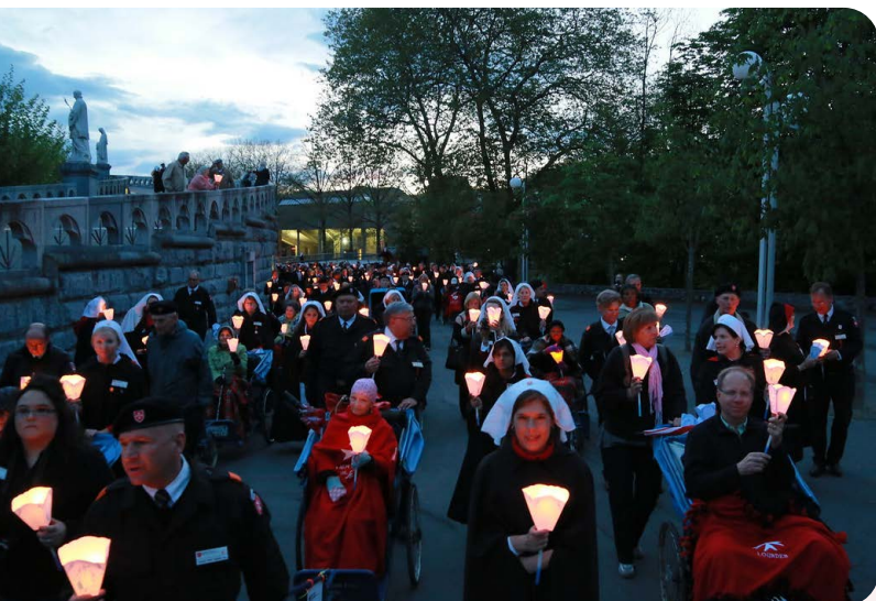
The candlelight procession is an unforgettable experience for those who pilgrimage to Lourdes.

Nestled in the heart of the Pyrenees mountains, alongside the winding Gave River, lies a grotto. The small rock cave, covered in the bright greens of small plants and mosses, was barely noticeable just 200 years ago. Today, however, millions of people flock to this spot each year, seeking the intercession of our Blessed Mother — for it was here that Our Lady of Lourdes appeared to the young peasant, Bernadette Soubirous, in 1858. With 70 miracles officially recognized by the Vatican and thousands more reported by pilgrims from around the world, Lourdes has long been considered a place of healing.