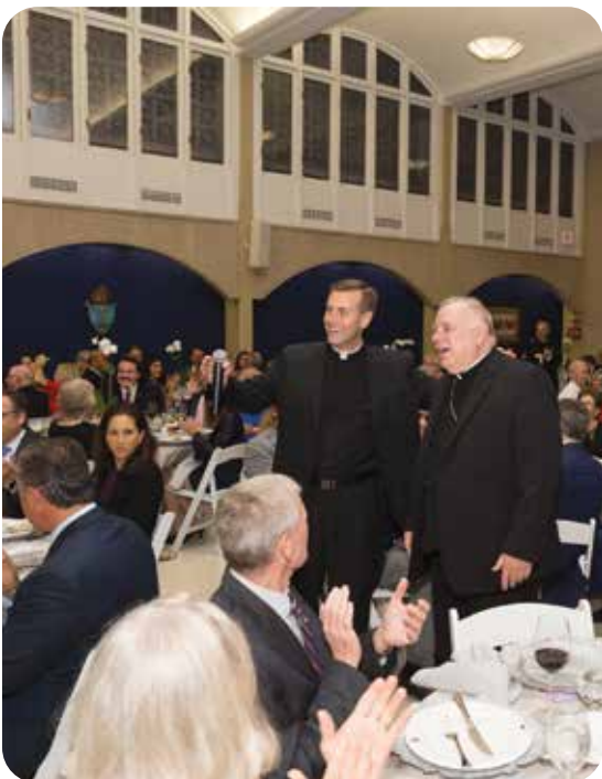
Attendees enjoy a wonderful time at the Friends of the Seminary Gala.