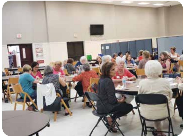
Widows of the parish gathered together for a monthly New Beginnings meeting.