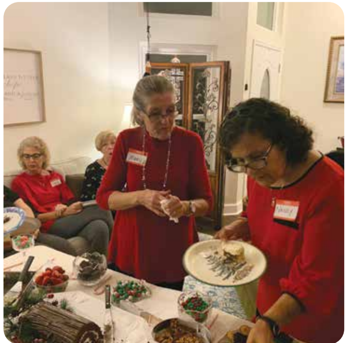
This new ministry of the parish allows parish widows to find a place within the community, building a beautiful sisterhood.