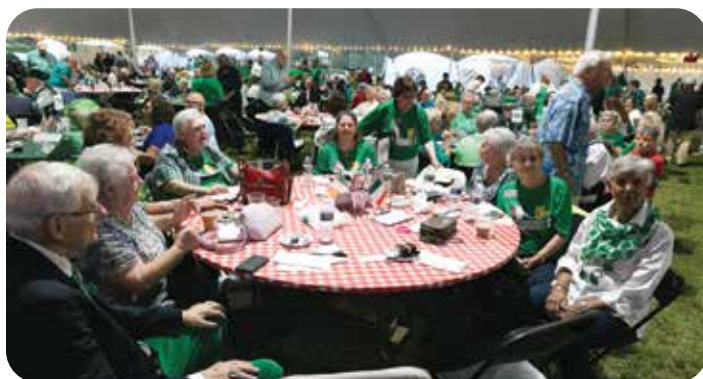
Patrons of the seminary gathered together for fun and fellowship during last year’s Joe-Paddy Celebration

If you would like more information about the St. Vincent de Paul Regional Seminary and its upcoming events, please visit www.svdp.edu .