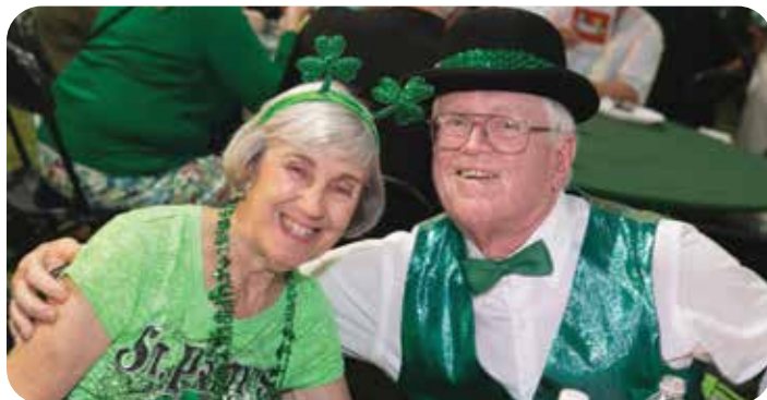
Bringing together the best of Italian and Irish cultures, the Joe-Paddy Celebration is always a great time.