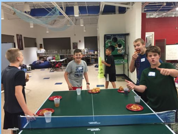
Middle School Students Enjoy Pizza & Ping Pong At The EDGE Lock-In.