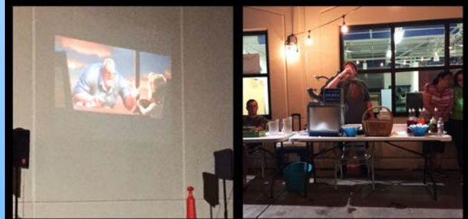
Youth Ministry & The Men's Club Partnered Up To Host A Family Movie On The Lawn!