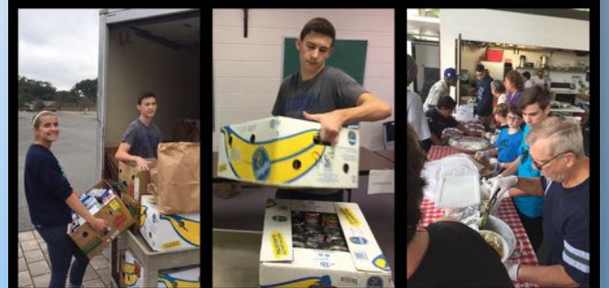
Youth Ministry Serves Our Neighbors At The Santa Maria Mission!