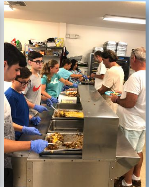
Teens Feed Homeless Home Cooked Shepherds Pie At Pinellas Hope.