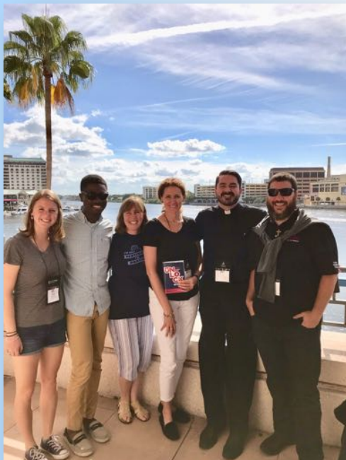
Youth Ministry Team Gathers At The NCCYM Conference in Tampa.