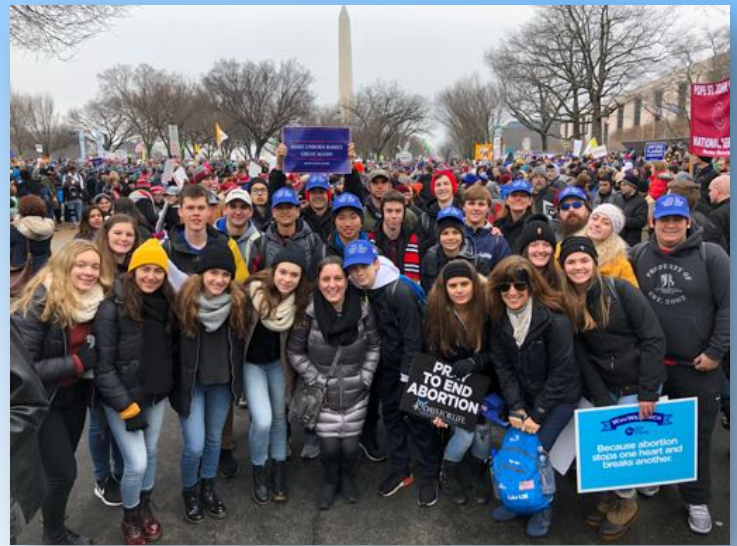
Youth Ministry Visits Our Nations Capital For The Annual March For Life To Defend Life!