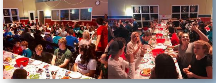
EDGE Middle School Had Their Annual Thanksgiving Dinner In The Youth Center With Over 100 Students!