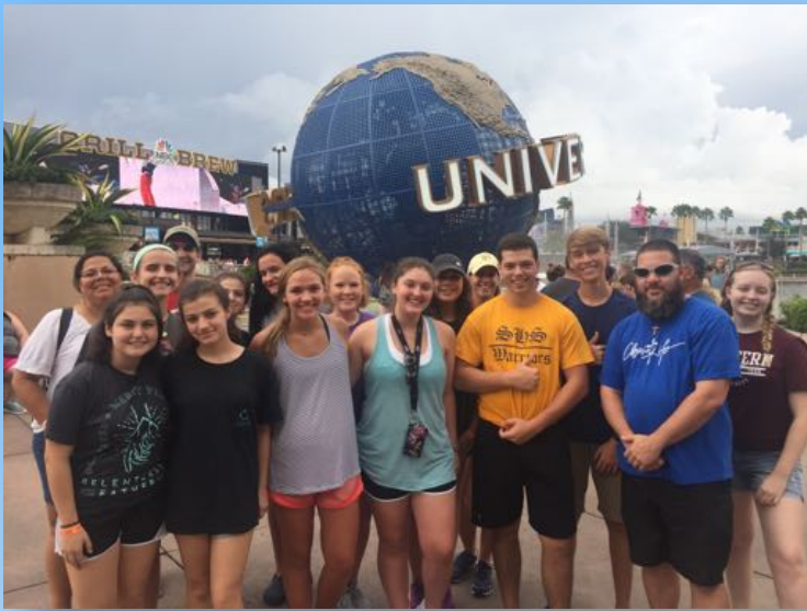
Teens Enjoy Christian Music Festival "Rock The Universe" At Universal Studios