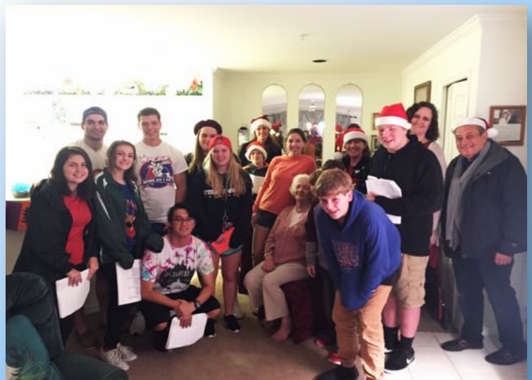
Students Visit St. Timothy Homebound During Christmas To Pray With Them, Sing Carols And Bring Them Gifts.