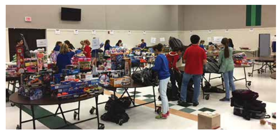
Eighth-graders from Mother Teresa of Calcutta Catholic School help sort Christmas toy donations for the St. Vincent de Paul Society.

"We're blessed that our parishioners give so much," she says. "When you ask for anything, they give you 10 times what you expect, so we are continually able to go outside of our own boundaries with what we can offer. And we believe in sharing where it's needed, so we have a list of other agencies that we are able to help, as well."