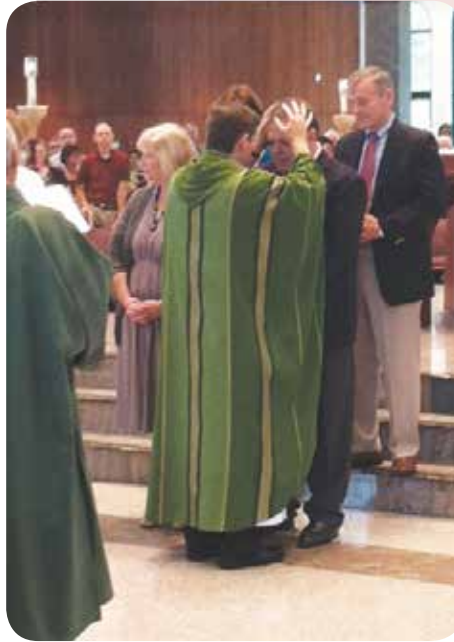
Each year, adults who were not previously confirmed go through the Adult Confirmation Program, in order to become fully initiated into the Church.

“[Confirmation] changed my life, actually,” he says. “I believed in God, but I was okay doing it my way,” he